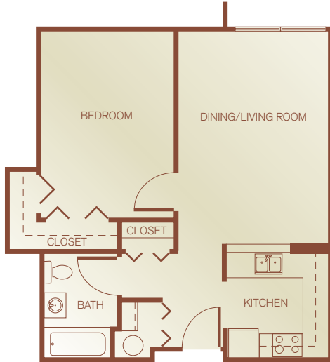
Unit Plan C 1 Bedroom, 1 Bath 628 Square Feet