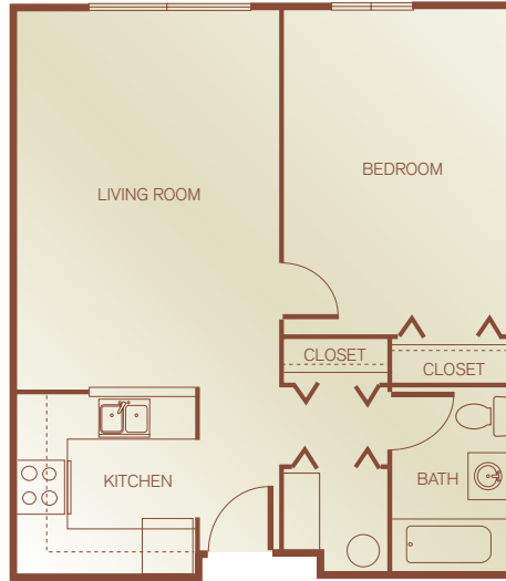
1 Bedroom, 1 Bath 616 Square Feet