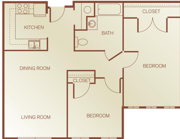
Plan C1 2 Bedroom, 1 Bath 818 Square Feet